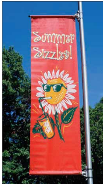
DRESSING UP MAIN STREET IS EASY TO DO WITH OUR BANNER BRACKET SYSTEM.