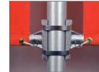
ALL BRACKETS ARE SINGLE OR DOUBLE BANNER BRACKETS

This state-of-the-art system is designed to withstand the elements. The base is made of rust-free cast aluminum with fiberglass arms. The fiberglass arms will flex in strong winds—transferring some of the wind load off the banner.